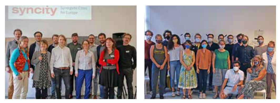
The Syncity team in 2019 and one year later, after the COVID-19 outbreak.

Over the year, Syncity became more theory-focused than originally intended. In response to this, the team decided to include insights from the whole project process into this handbook, and to broaden its scope with conceptual input, moving back and forth between theory and practice, as the Syncity project did.