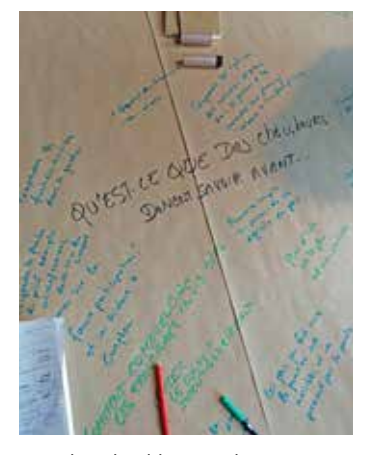
What should researchers know before they start working in a neighbourhood? A Syncity brainstorming session.

This section presents the Syncity project and explains how it led to an innovative approach for urban transformation and planning. It introduces the five parts of the book and how to use them.